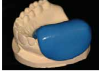
Make a silicone matrix.