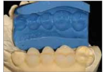
Wait 2 minutes and remove.