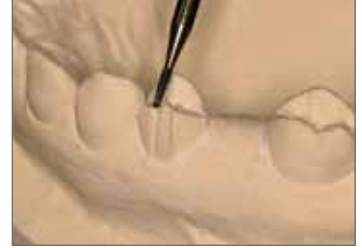
Make depth cuts 1.0 mm.