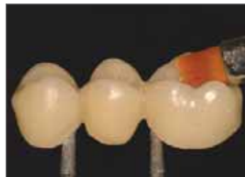
Apply the sealer/glaze and cure.