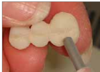
Sandblast to clean.