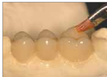
Apply the sealer.