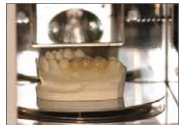
Cure using the correct cycle.