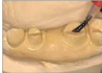
Apply the model separator.