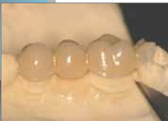
Remove from the model and finish.