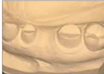
Uniform 1.0 mm reduction.