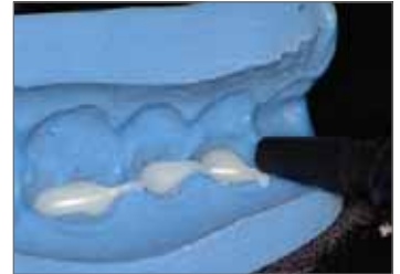
Express the enamel.