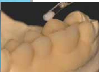
Add on additional material if necessary.