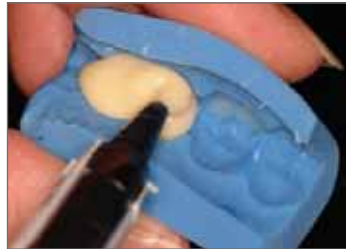
Express the dentin.