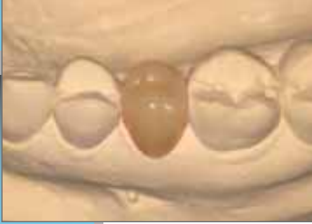
Fill in the edentulous areas.