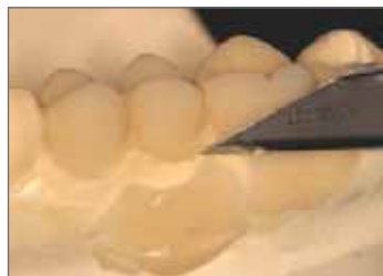
Remove the excess material.