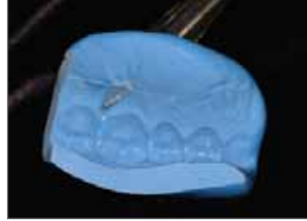
Trim the matrix.