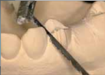
Open the interproximals.