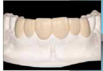
Wax to full contour.