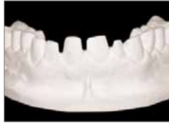
Uniform 1.0 mm reduction.