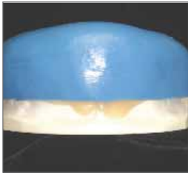
Matrix in place.