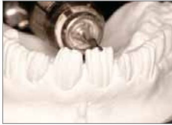
Make 1.0 mm depth cuts.